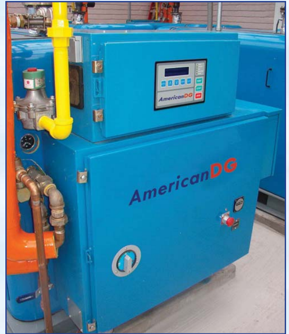
Clean, efficient combined heat and power (CHP)

No Cost | No Responsibility | No Risk Just Savings